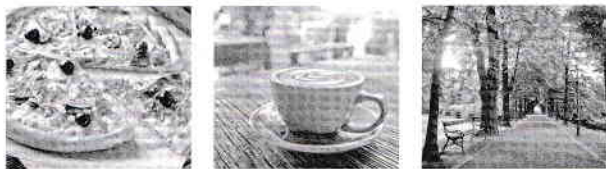
B ..... D ..... F .....

2 A Write a word or number to fill the gaps.