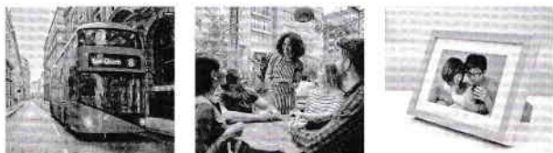
A ..... C .....

B Match the words (1–6) in Ex 1A with the photos (A–F).